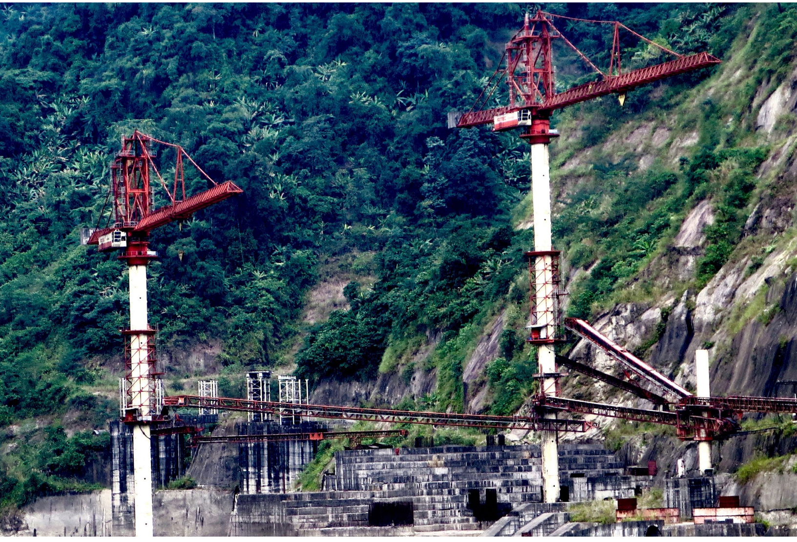
NHPC's planned Lower Subansiri project, which is being built in the Himalayan foothills, threatens the area's delicate biodiversity and the livelihoods of indigenous communities.

NHPC owns, either outright or through joint ventures, nearly two dozen large dams in India, with a number of others planned or being constructed. These dams have displaced hundreds of thousands of people, damaged crucial waterways and biodiversity, and provided few benefits to the people living near them. In many cases, communities affected by these projects have resisted their development. Regardless, NHPC has pressed forward, indifferent to the outcry.