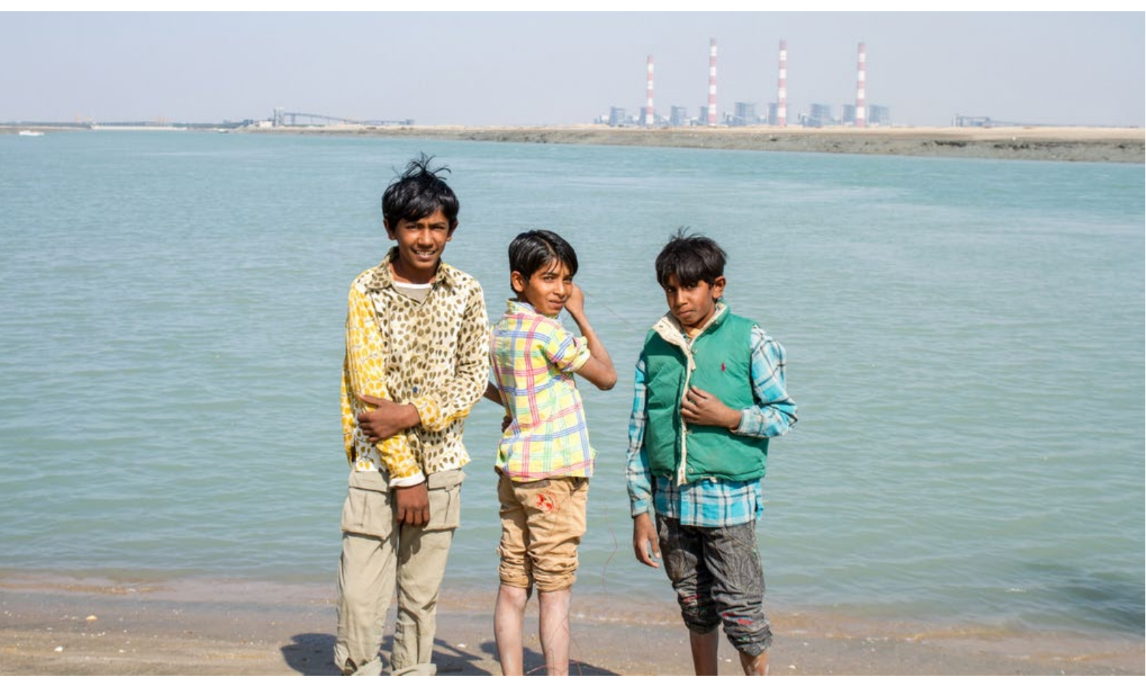
The Mundra complex, located in Gujarat state, includes a coal plant, port and special economic zone. It has polluted the ocean and displaced local fishing families. The IFC's commercial bank clients financed both the complex and the company that owns it, Adani.

financing from the IFC has instead received those funds through back channels.