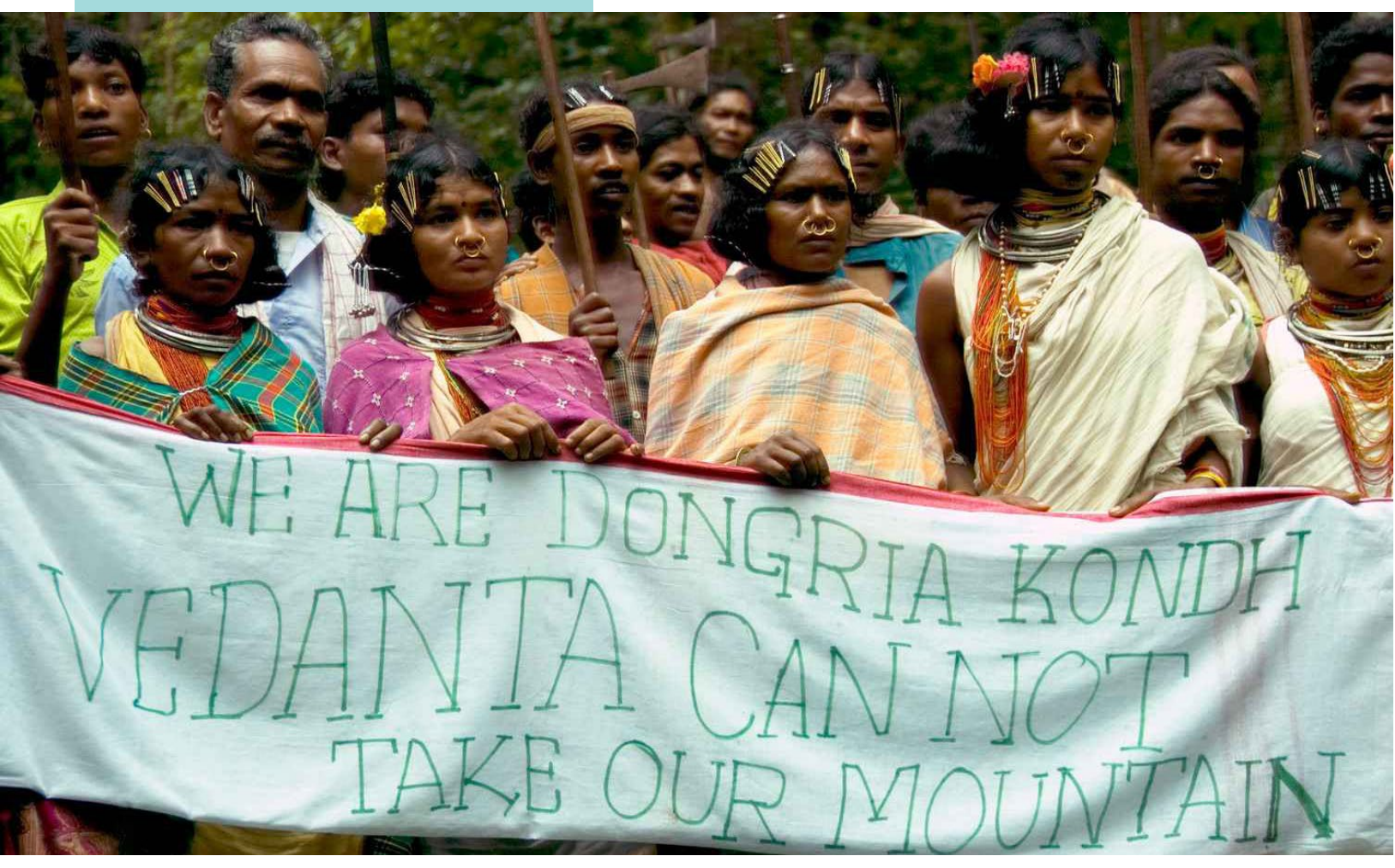
Members of the indigenous Dongria Kondh tribe demonstrate against a planned bauxite mine in the sacred Niyamgiri hills. The project by Vedanta Resources was ultimately stopped, in a landmark victory for tribal rights in India.

Even more troubling, the IFC's financial-sector clients have financed companies with well-documented track records of complicity in grave human rights abuses and environmental degradation.